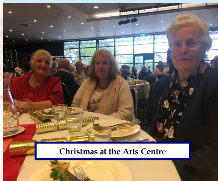
Christmas at the Arts Centre